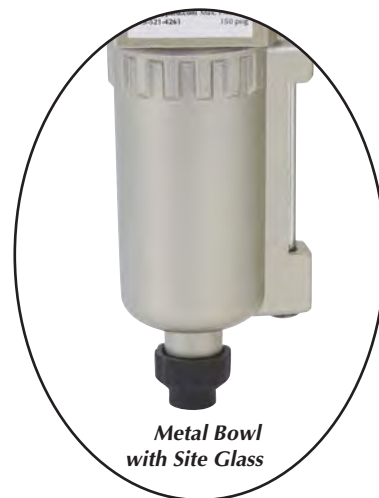
Metal Bowl with Site Glass

Polycarbonate bowls are standard on all filters and lubricators. Bowl shields are standard on MMF/MML 4A and 5B. An optional metal bowl is available for filters and lubricators.